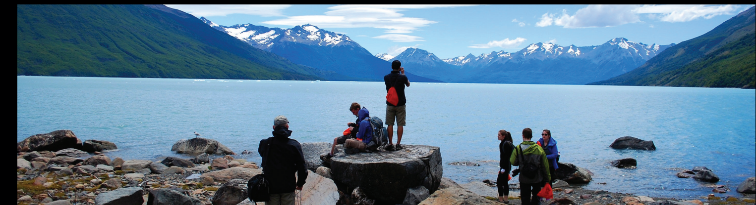
PLU seeks to educate students for lives of thoughtful inquiry, service, leadership and care—for other people, for their communities and for the Earth.

PLU is different. We're committed to you as a person , and we're committed to developing the mature, thoughtful, dedicated, creative leaders the world needs.