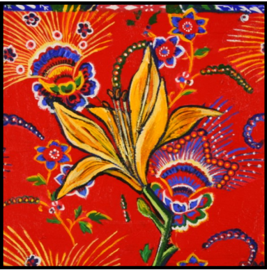
Dalarna Day Lily, 2007 (8x8")

8%2/ ) . */4)- "069 !Dekorglädje) Swedish Paintings by Alison Aune