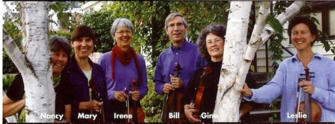
Hale Bill and the Bopps