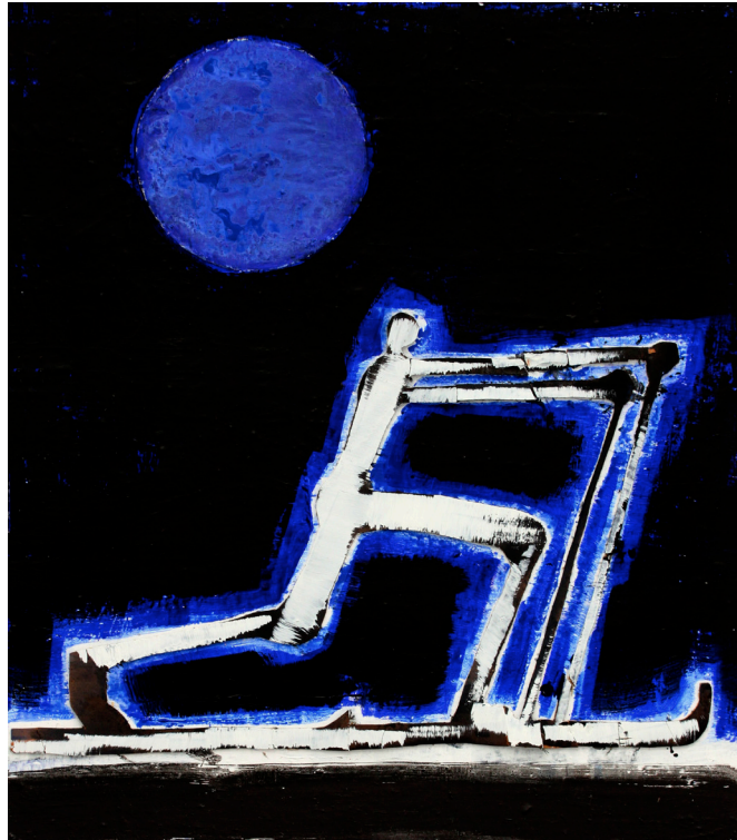
Nordman 1, one of the more than 30 works that will be on display during the exhibition.

and stability, to the struggles facing democracy and globalization. Accompanying the show is a scholarly volume with essays by leading authorities on the history and importance of the Norwegian Constitution. The exhibition and the publication were curated by Trond B. Olsen of ArtPro, Norway, who will give a speech at the special “Members Only” preview on August 23rd. The title of