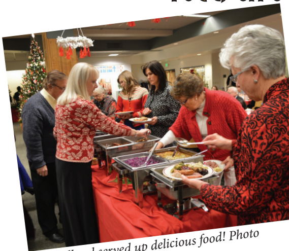
The julbord served up delicious food!