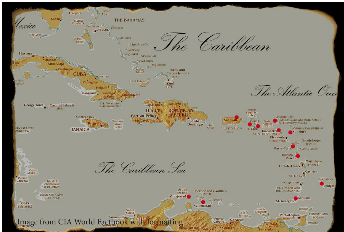
with formatting