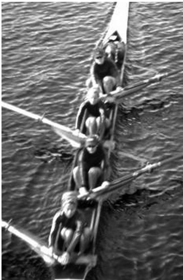
The PLU women's crew team competes in the Head of the Charles Regatta in Boston against top-ranked teams like MIT and Harvard. The Lutes finished ninth out of 29 teams in the openweight four competition.

While the two women's teams were in Boston, the other members of the PLU crew team were also competing. Three novice boats and both a men's and women's varsity boat raced at the Charlie Brown Regatta in Portland over the weekend. Both the novice women and men fours won first in their races, rowing against division rivals Lewis & Clark, Willamette and