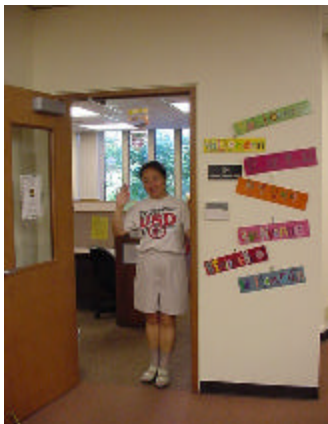
We are located on the first floor of PLU's library.

Here in the LRC we are committed to helping students with all of their language course needs.