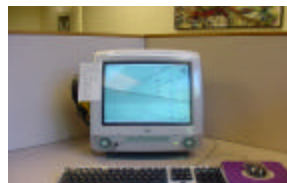
5 iMacs w/DVD