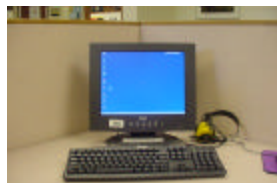
16 PC workstations