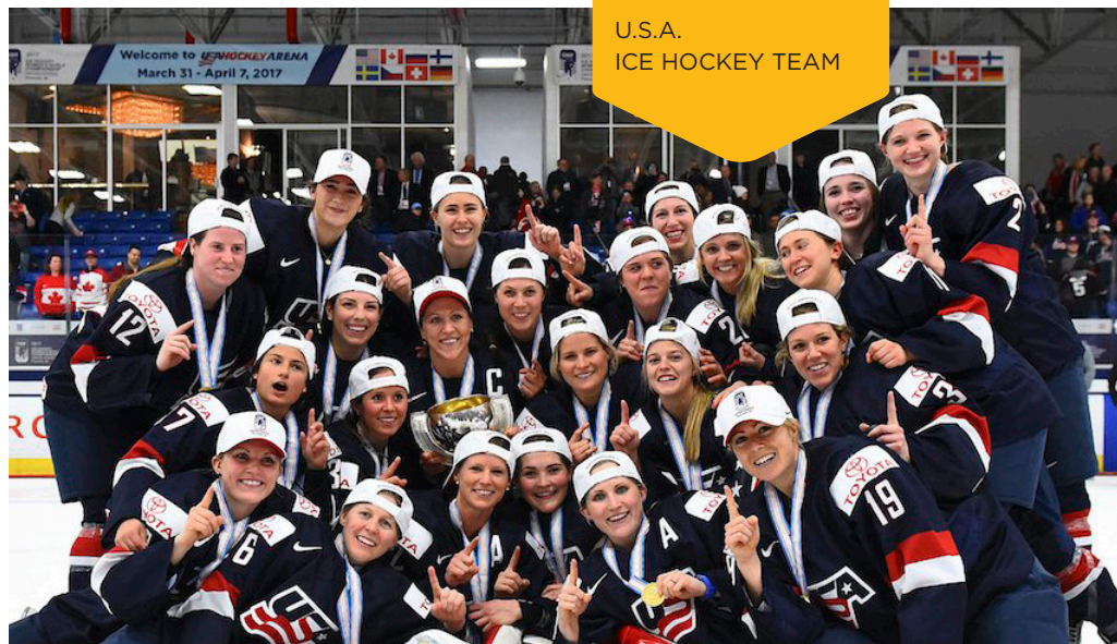
U.S.A. ICE HOCKEY TEAM