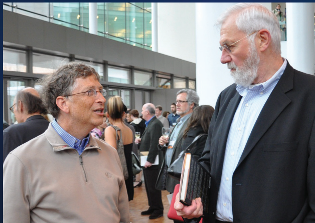
Senior Medical Advisor for the Bill and Melinda Gates Foundation