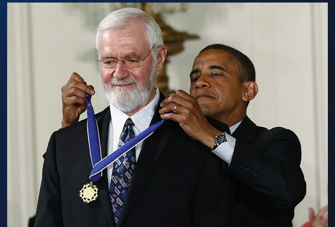
Presidential Medal of Freedom Award Winner 2012