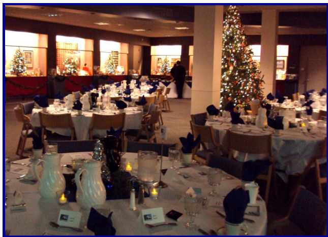
The tables are set, the trees lights are glowing, and the candles are gleaming—just waiting for guests to arrive. (2011 Photo)

Plan now to attend this unforgettable evening of fun, food, and fellowship, and make it a part of your annual holiday celebrations. Admission: $40 (General) and $35 (SCC members). Reservations are required. Invitations will be in the mail soon.