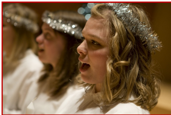
Lucia 2010 Photo