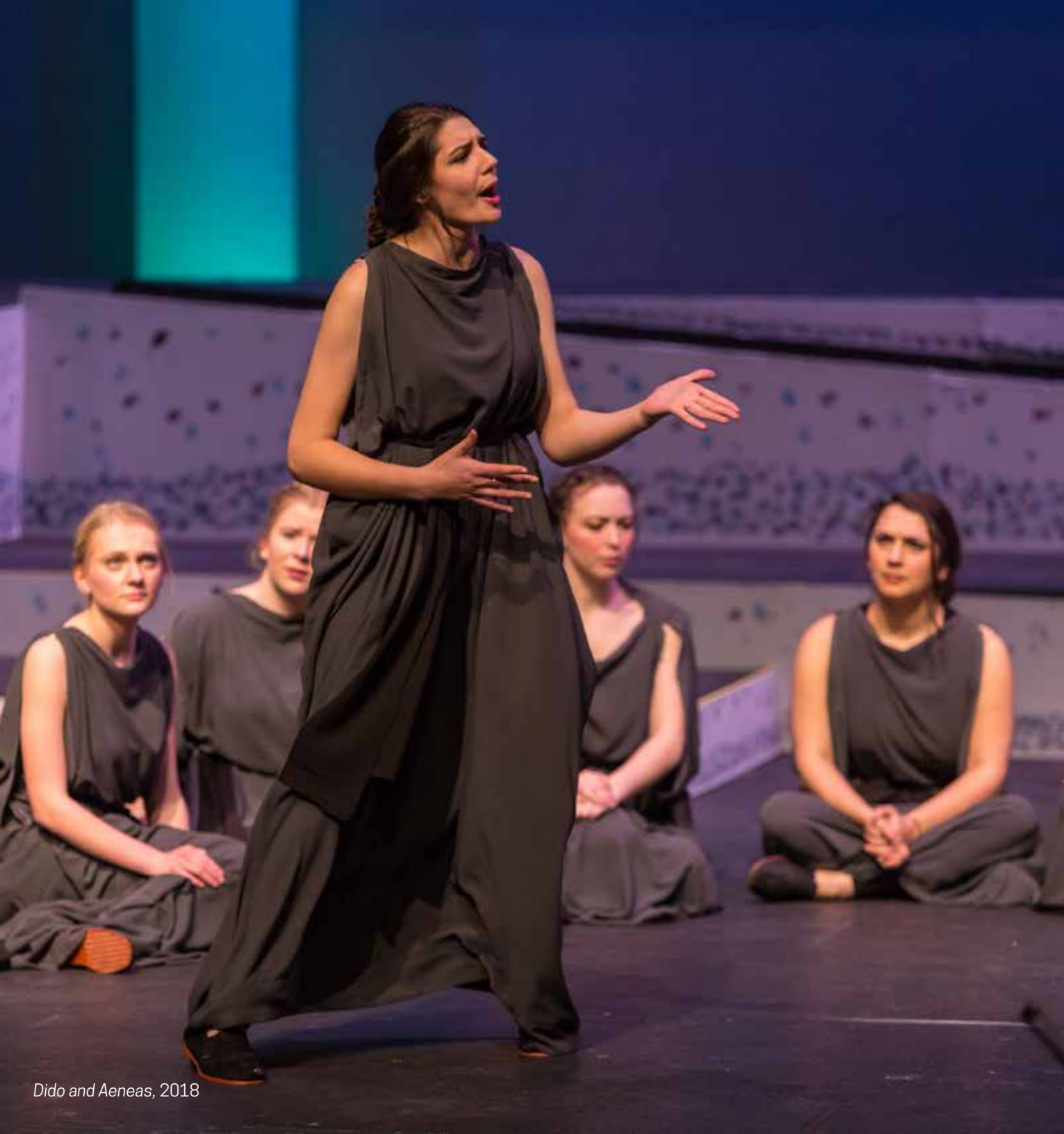
Dido and Aeneas, 2018